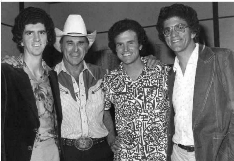
FAMILY with Reg Lindsay 1975

Hallelujah, hallelujah, Hallelujah, hallelujah, Hallelujah Day, sing hallelujah, Love is on its way. It's coming to ya. Hallelujah Day, sing hallelujah, Love is on its way, It's coming to ya. Hallelujah Day, sing hallelujah, Love is on its way. It's coming to ya.