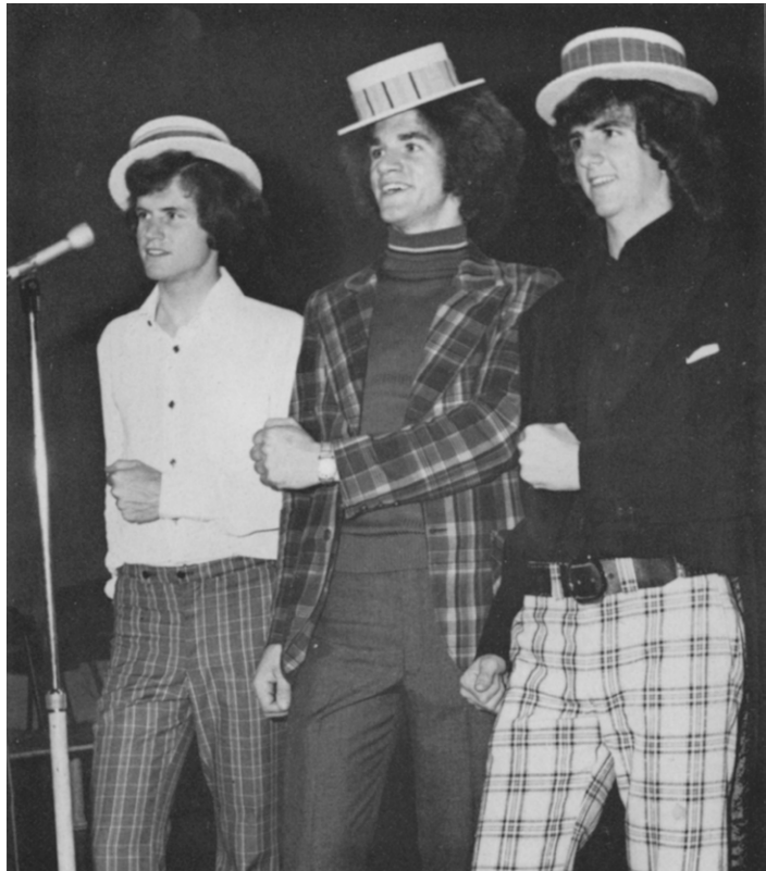
FAMILY appearing on Channel 7, Brisbane April 1973.

Even if there weren't a forever Oh I'd still have my love for you Even if there weren't a forever I'd have given my life to you