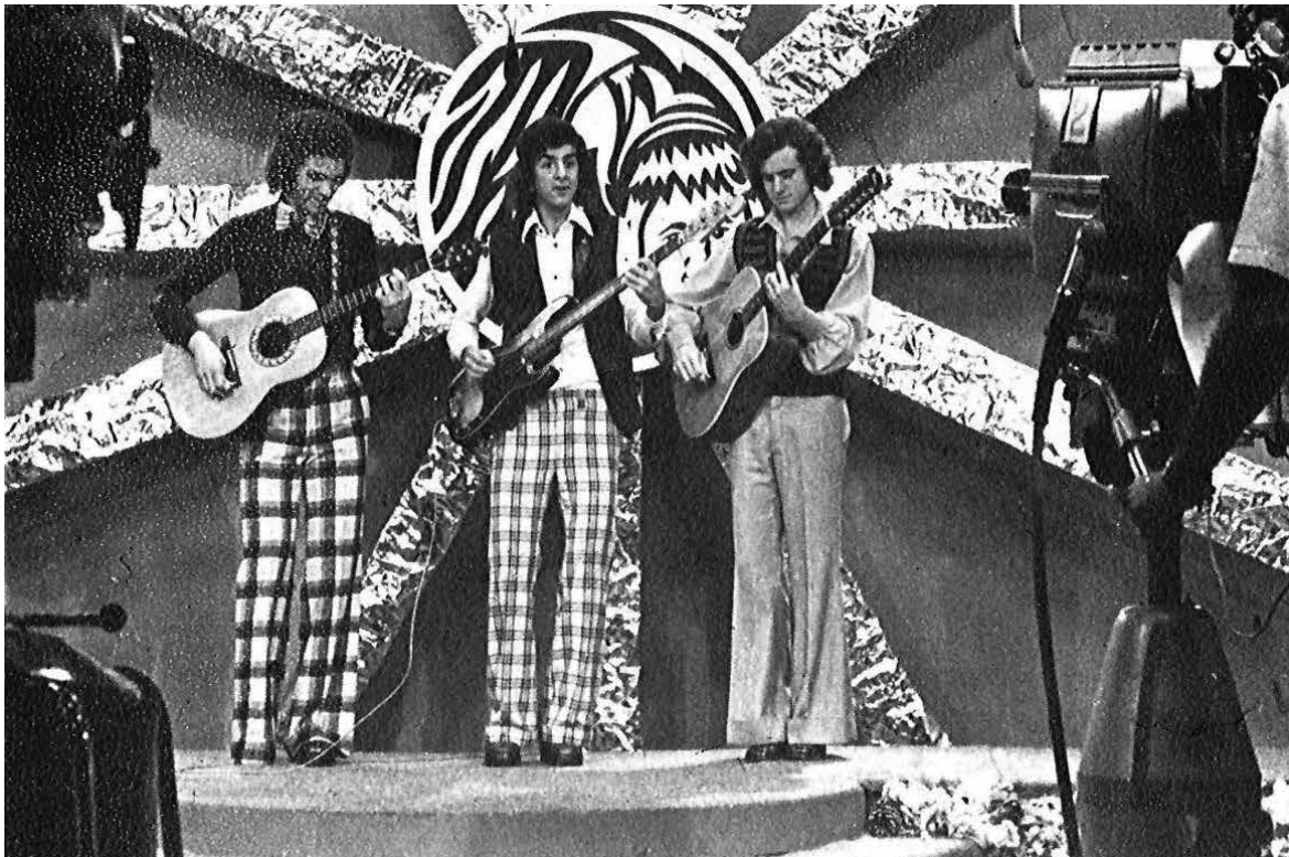
FAMILY being televised for a TV Show

Don't fret but let God work things out Assured that He knows best Delight yourself in who He is He's working you can rest REPEAT