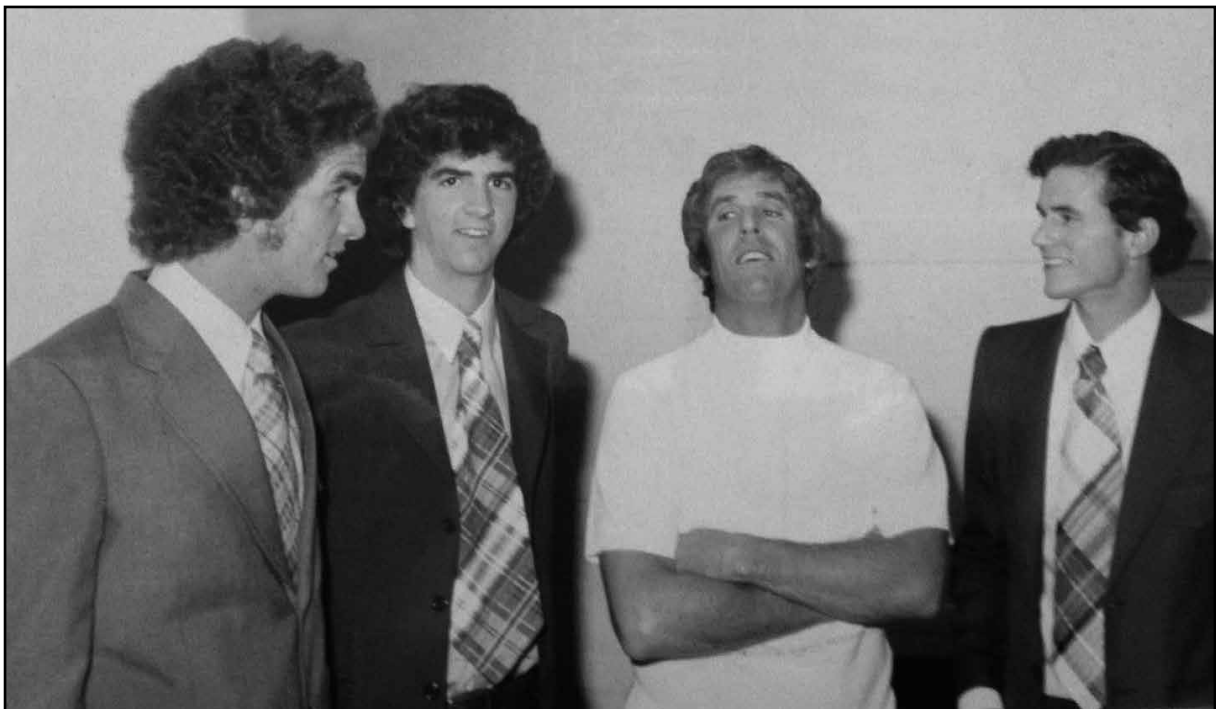
FAMILY touring with Burt Bacharach in 1973

Your love means everything to me Your love is everything I need Oh oh oh, without your love what would I be? I was lost until your love found me Your love means everything to me Your love is everything I need