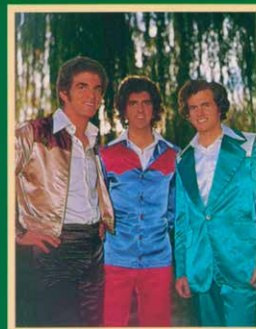
How's that for Coloured Gear - from 1976 National Tour.