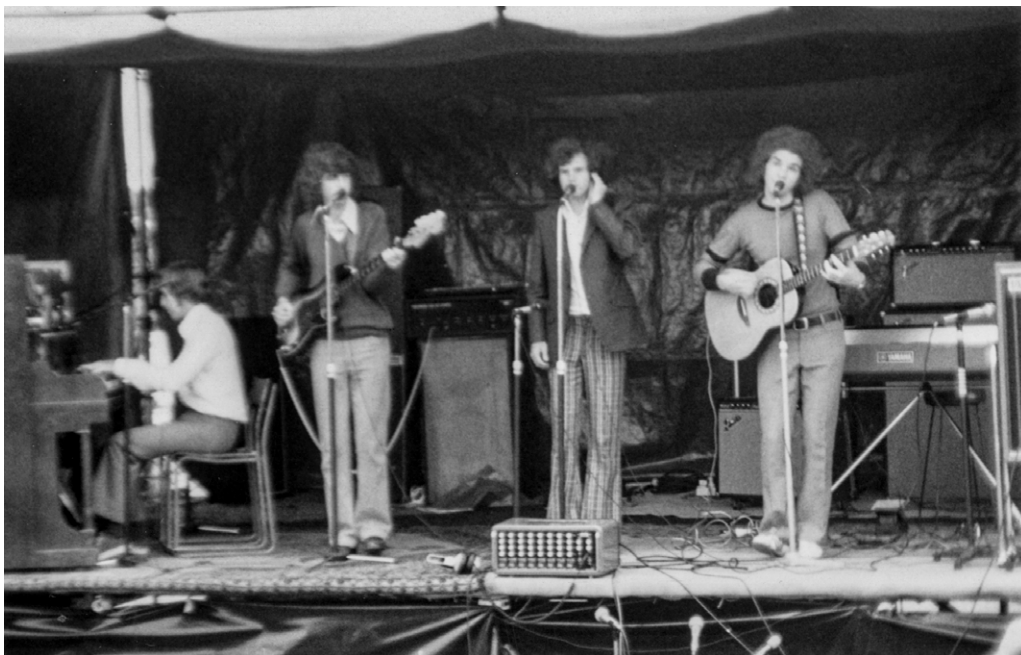
FAMILY at a music festival at Morwell Uniting Church, Victoria Dec. 1973

In the book In the book In the book In the book In the book In the book In the book Take another look In the Book of Life