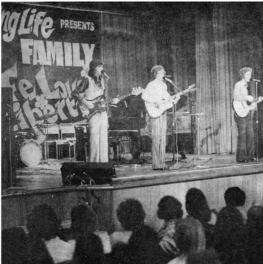
FAMILY playing at a "Young Life" Jesus rally at Unley Town Hall, Adelaide 1974

We're part of the family There's more of us than you see We're part of the family And we want to get you with the Father We're part of the family And we want to get you In the Father's arms